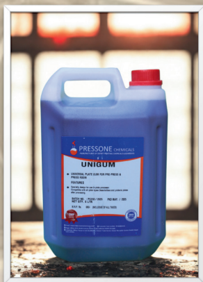
Plate Processor Gum

A universal developer designed for all CTOP plates, this highly concentrated alkaline solution ensures consistent performance with a prolonged bath life and is fully compatible with all PS printing plates available in the market.