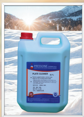
Plate Cleaner SP

A high-quality, general-purpose plate finisher and desensitizer, this product is compatible with all available PS plates and suitable for use in all automatic plate processors, offering excellent desensitizing properties for reliable performance.